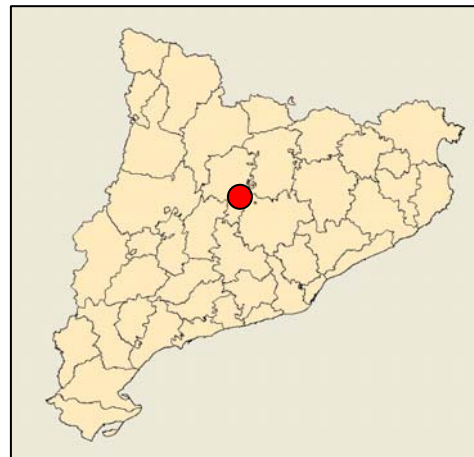
Field trial location in Catalonia