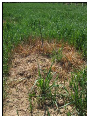
Field trial at year 1